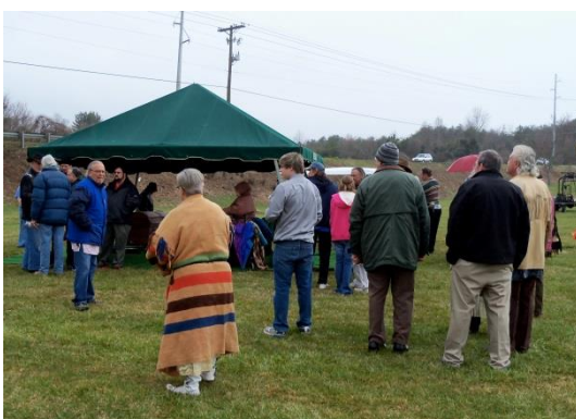
At Highland South Cemetery in Seymour, Tennessee