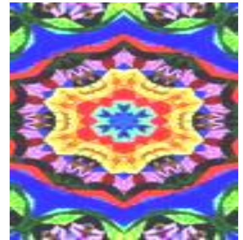
MORE DIGITAL ART BY DIANE SMILING WOLF BEATY

Digital art is a new medium whereby the artist "pushes pixels", those color bits one sees on one's computer monitor, rather than using the traditional tools of the artist such as paint and brush. This medium utilizes one's creativity as much as the other forms. The only things that have changed are the tools being used.