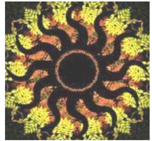
PARMANU-6 by Diane Beaty

This story begins with weight and balance, a rain that trickles and spends itself over a sea, renourished, that bumps and bunches along the shores of longing's ache. The shaken deep heaped in a dull thud along these croppings, along these stones that, built-up, creep like long, thin fingers. Flesh and sand. Seas's articulate tang welded to this skin, to these bones marooned in an ancient brew that ebbs and powers, circles and wails, breathes fire's own ash. Time void of event inhales all emptiness. We are this water, are this same stone pounded for centuries, are the stiff imagined skin bathed in the light, in the breadth and width of someone's singing. We are the last edge scraped loose; the continuous echo ducking, dodging, these half-seen shadows.