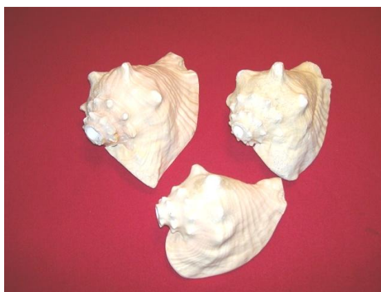
Conch Shell Horns $40 ea. $15 S/H

License plate $10 & $3 S/H Patch $10, Decal $2