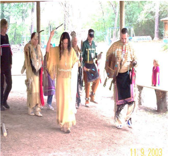
Dancing in regalia in the Ceremonial House is an important part of our ancestral culture.