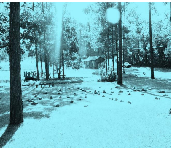
Below are seen the stones that comprise the Medicine Wheel at the National Tribal Grounds. These stones are ever changing and growing in numbers.