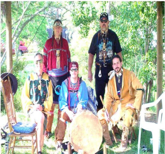
Above is seen the Tribal Drum and drummers.