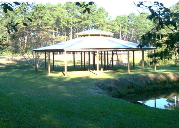
Above: The Council and Ceremonial House at the National Tribal Grounds in Ochlocknee, Georgia.