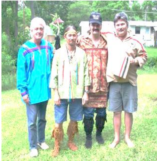
Some men of the tribe.