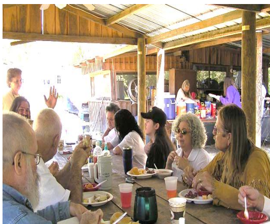
Feasting at the "Elders' Table".